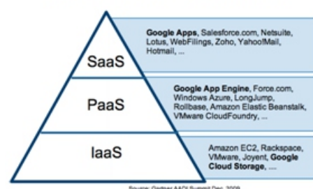
Fig 1 : Types of services