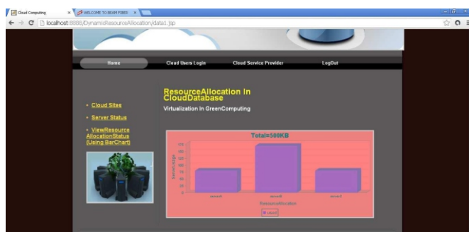
Fig. 4 View Resource Allocation Status using Bar Chart

The results are clear and having good contribution: