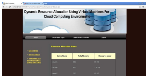
Fig. 3 Resource Allocation Status

A data center, installing virtual infrastructure allows several operating systems and applications to run on a lesser number of servers, it can help to reduce the overall energy used for the data center and the energy consumed for its cooling. Once the number of servers is reduced, it also means that data center can reduce the building size as well. Some of the advantages of Virtualization which directly impacts efficiency and contributes to the environment include: Workload balancing across servers, Resource allocation and sharing are better monitored and managed and the Server utilization rates can be increased up to 80% as compared to initial 10-15%.