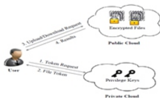
fig: Architecture of Authorized de-duplication

• If a user has privilege p , it requires that the adversary cannot forge and output a valid duplicate token with any other privilege p' on any file F , where p does not match p' . Furthermore, it also requires that if the adversary does not make a request of token with its own privilege from private cloud server, it cannot forge and output a valid duplicate token with p on any F that has been queried.