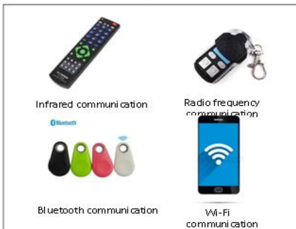
Fig. 1. Common wireless communication technology for home appliances

wireless technology used by the manufacturers on their electrical appliances. The description of the wireless technology as defined by Techopedia [13] is presented in Table I.