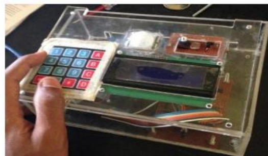
Fig.3. Hardware system

also soldered and mounted carefully on the casing. Each of the hardware modules were tested as they were acquired and all were confirmed to be good and usable for the project. Also, during each of the stages of construction, the modules were tested and each was confirmed to work as required independently as well as conjointly. Figure 3 shows the coupled CPE in a transparent casing revealing the embedded hardware system.